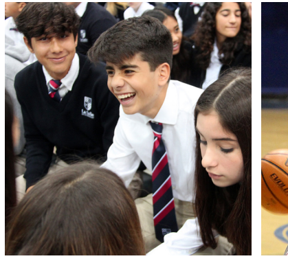
Welcome to La Salle College Preparatory, where young adults discover their purpose and pursue their passion.